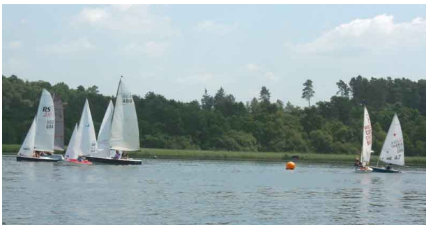
10Hr Race- The Access Team takes on the Big Boys!

The FPSC 10 Hour Race The Access class entered 1 team "The Boatles" and finished a best ever 4 th place of 24 teams and were credited with the fastest lap as well thanks to Lindsay's efforts. The 2.4mR class entered 2 teams who were evenly matched: "The Mamas and Papas" came 5 th and "The Drifters" were 6 th .