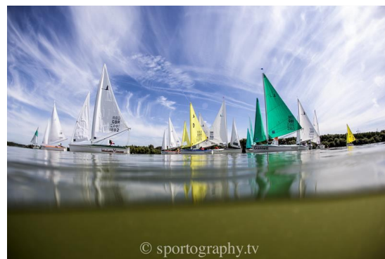
A stunning photo taken at Burghfield