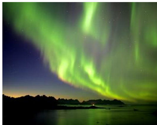
A Spectacular Display of the Northern Lights