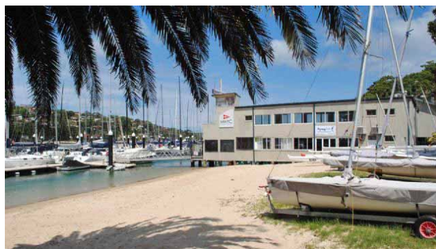
Middle Harbour Yacht Club, Sydney