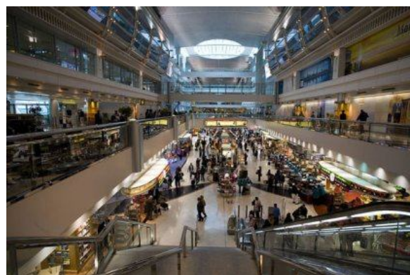
Dubai Airport Duty Free Shopping Area

When the time came, it was back into the aisle chair, to be dragged to the jumbo jet's toilet block. The very helpful air stewards curtained off one of the tiny little toilets, to enable Gwyndra to help me.